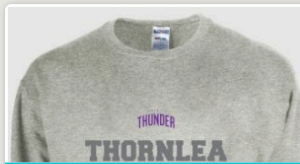
HOODIES & SWEATSHIRTS